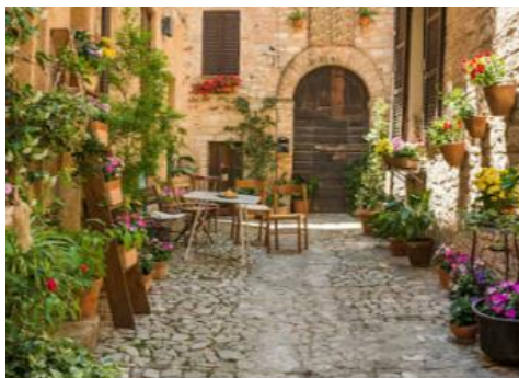
Picture from Nocera, Umbria, Italy

There is a charging station for electric cars (can be used at additional cost).